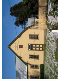
The event will take place in the warm southern summer. It can also get cold here in winter!

Making sense of new places and nations is greatly assisted by 'getting out' and informally experiencing and sharing adult learning, in place and in practice. The one-day Australian study tour of community-based adult education (13 Feb) of the Central Highlands region will start and end in Ballarat. The one day New Zealand study tour of community-based adult education (17 Feb) will start and end in Wellington including the Wairarapa region. There will be opportunities on 12 & 18 Feb for site seeing and cultural exchange.