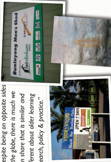
Some older learning traditions in Australia & New Zealand are Indigenous or 'home grown'. Others derive from Europe.

“Despite being on opposite sides of the globe, there is much we can share that is similar and different about older learning research, policy & practice.”