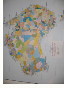
Australia has 300 Indigenous Nations, as well as immigrants from all over the world.