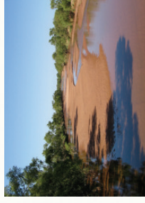
Much of Australia is sparsely populated, but diverse and very beautiful (NW Australia)