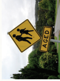
Population aging and learning are important issues in all nations.

Each conference has a different but complimentary theme related to older learning. The Ballarat, Australia Conference (14 Feb) will focus on rural and regional community learning. The Melbourne conference (15 Feb) will highlight older learning in urban contexts. The Wellington, New Zealand Conference (16 Feb) will emphasize older learning in Indigenous and Immigrant societies, through the unique bicultural ( Māori / Pakeha ) lens of ACE Aotearoa.