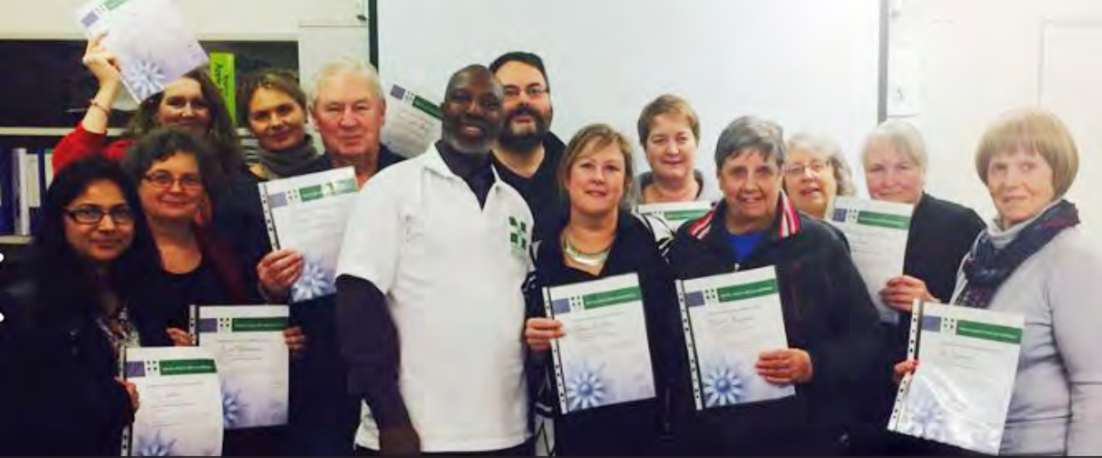
Diamond Valley Learning Centre's first mental health first aid class celebrates their graduation.

'It was a fantastic course. I feel well equipped and know now what to say and what not to say. I'm more observant now. I notice symptoms and signals. For example, I'll notice now if someone seems a bit withdrawn, or if their work isn't up to scratch or if they might look unusually scruffy. I see these signals and I'll make an approach and say, "Are you all right, do you need to talk?"'