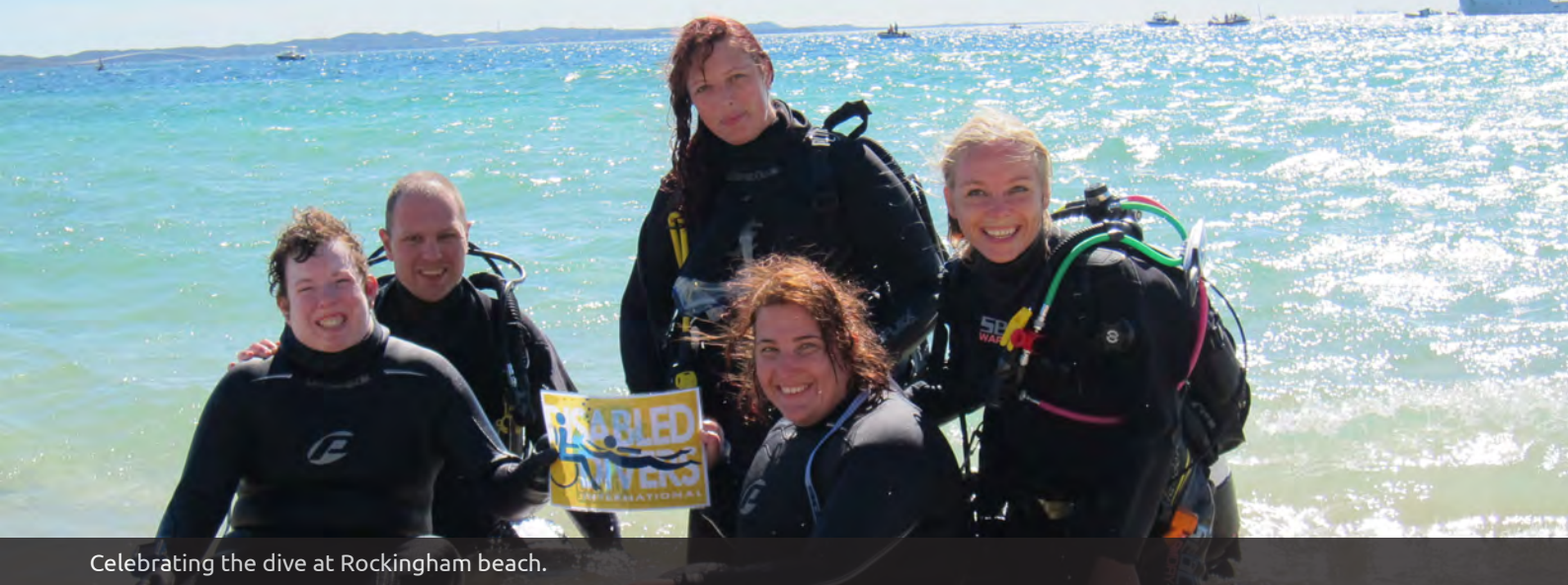
Celebrating the dive at Rockingham beach.